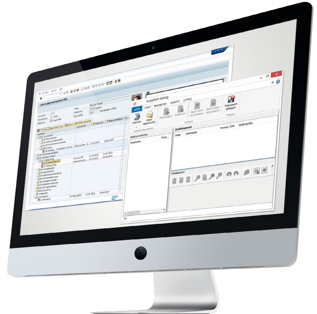
Call up of d.capture dialog from the personnel file

We would be glad to answer any further questions. Here you will receive a strong and practice-orientated consultation from our specialists. Contact us, because a real team is made of people.