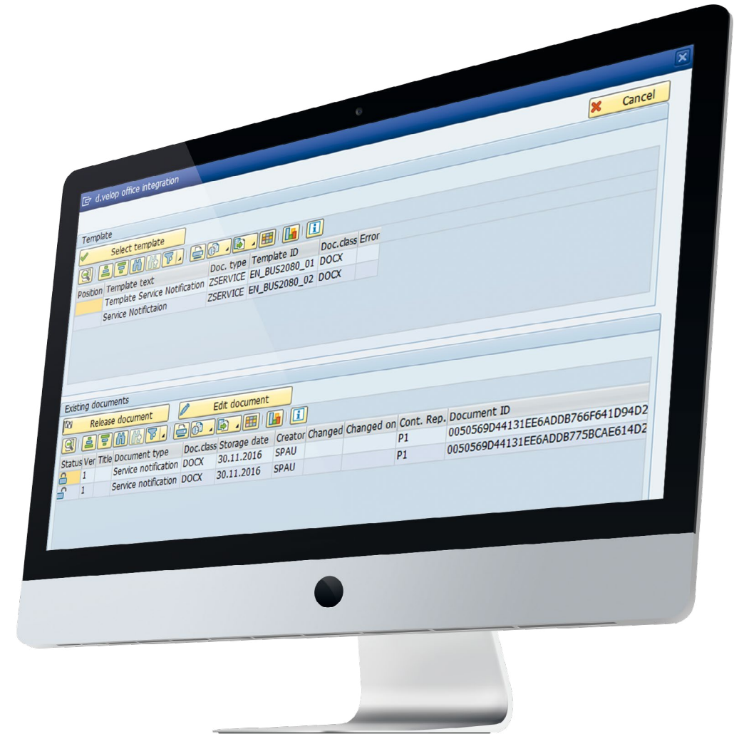
All templates can be stored in one place with the push of a button.

We would be glad to answer any further questions. You will receive thorough and practical advice from our specialists. Contact us – because a real team is made of people.